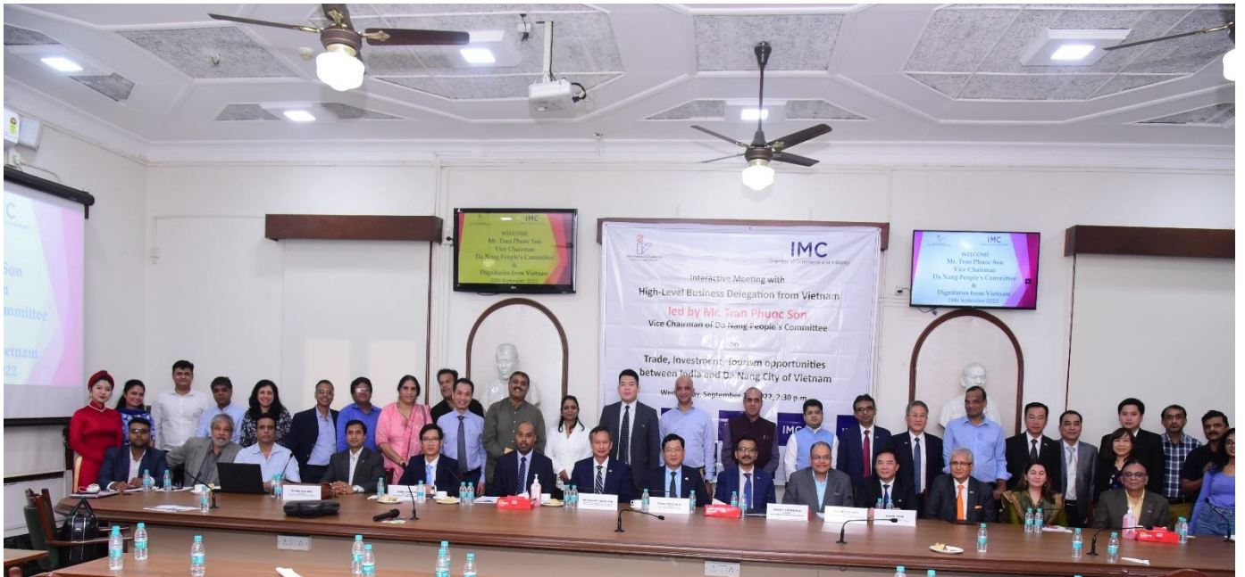
IVCCI and IMC members with Delegation members