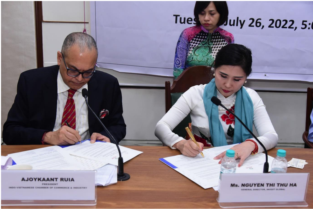
MoU signing ceremony between Indo-Vietnamese Chamber of Commerce & Industry and Invest Global