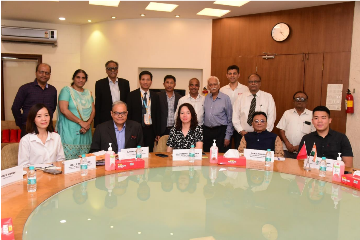
IVCCI members with Vietnam delegation members